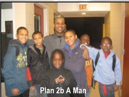
Plan 2b A Man