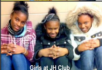
Girls at JH Club