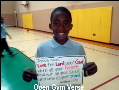
Open Gym Verse