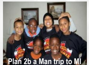
Plan 2b a Man trip to MI