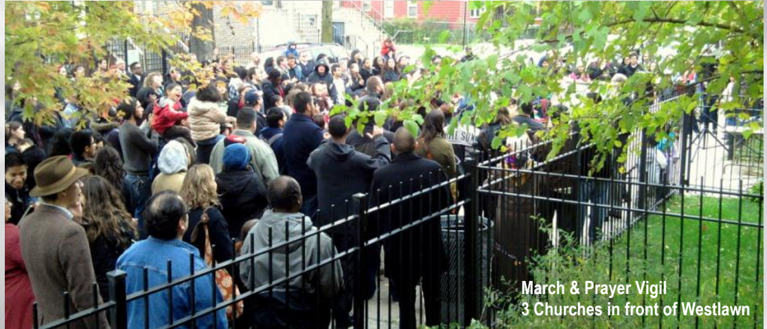
March & Prayer Vigil 3 Churches in front of Westlawn

Updated Weekly! — The WYNdow http://thewyndow.posterous.com